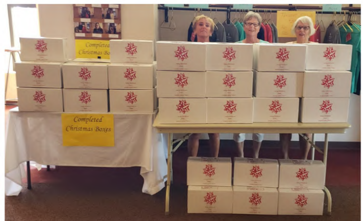
Completed Boxes, Ready to Be Shipped