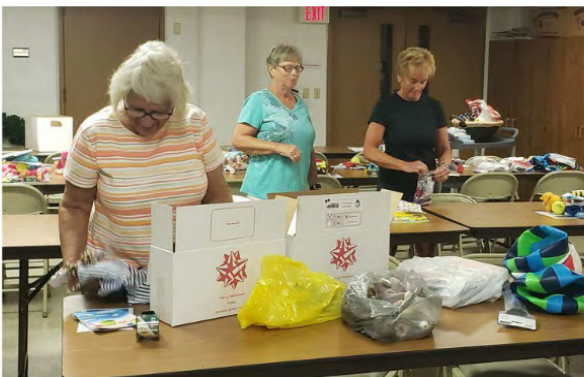
Craft Group Volunteers Filling Christmas Boxes

Here is a summary of the response to the Christmas shoeboxes incase you missed the bulletin. Of the 102 boxes filled; 50 were filled by the craft group, approximately 28 were filled using monetary donations and the remaining boxes were filled by congregation members. In addition we had donations of underwear, socks, coloring books and crayons. The large carton of underwear and socks will be sent along with the Christmas boxes.