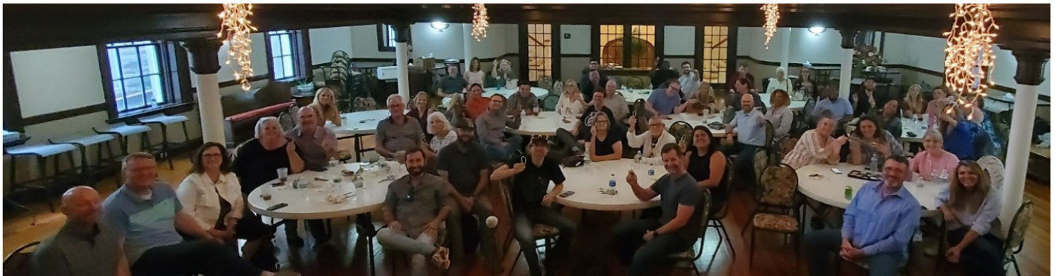
A group photo of our 2023 Summit Leadership Gathering comprised of speakers, sponsors, and host ministries.