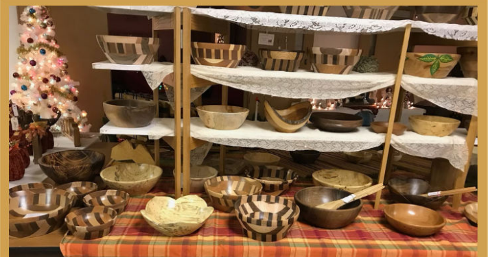
A few examples of incredible crafts from last year's Fair.