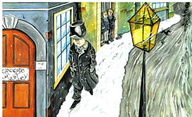
Don't miss out on the joy of Christmas